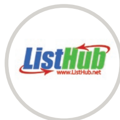
Global Marketing for Listings