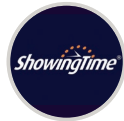
Showing Management Tool