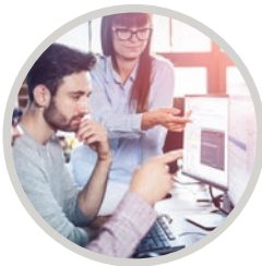
Custom Built Internal Site