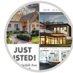
Custom Built In-House Marketing Program